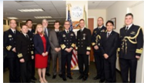
International Naval Partnerships