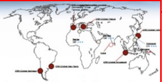
International Research Community